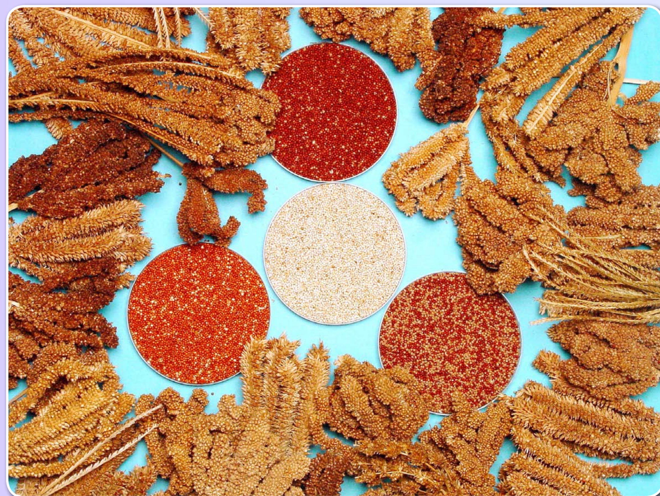
Variability for finger size, shape and seed color.