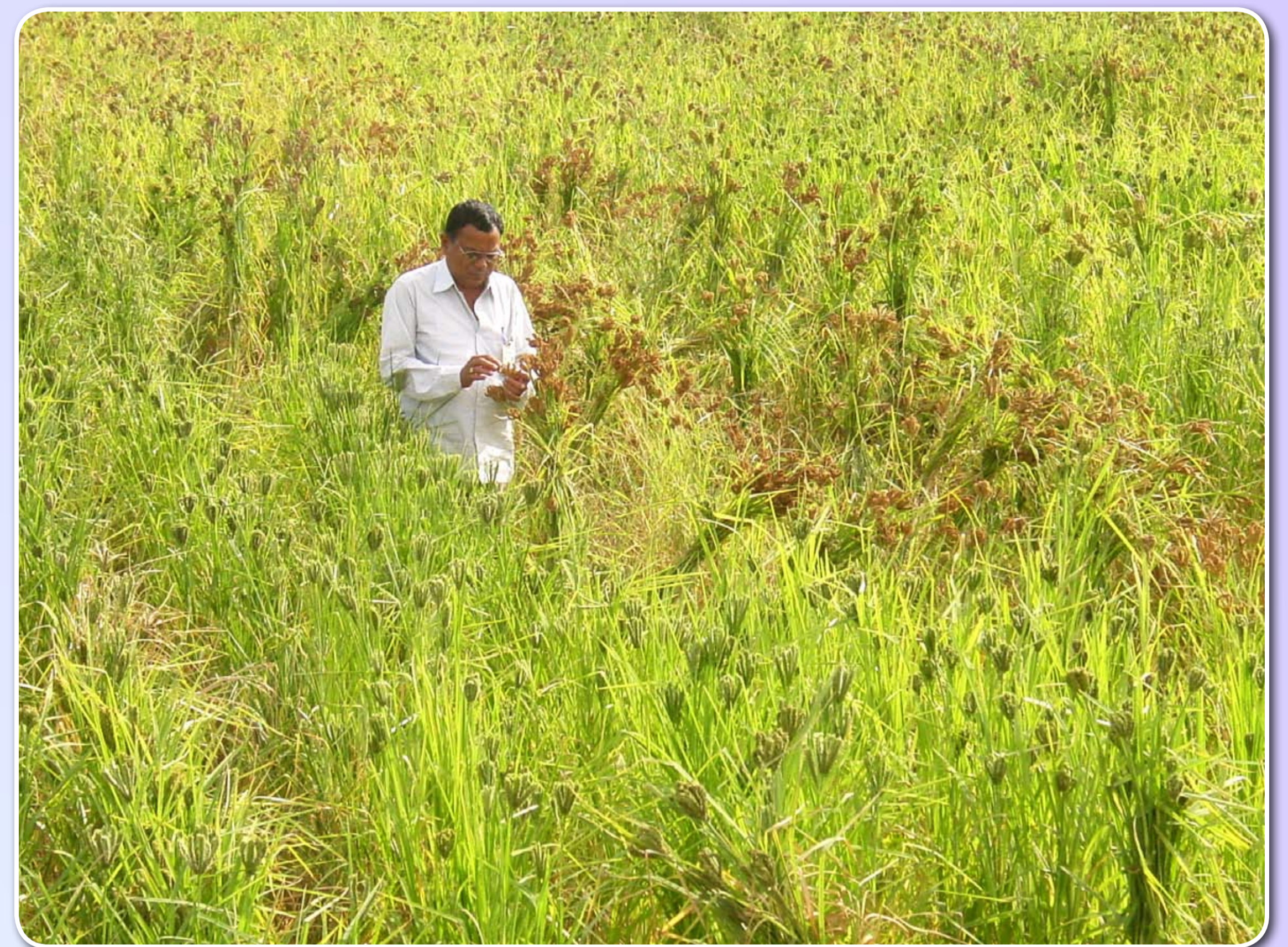
Evaluating the reference set.

Three hundred accessions of reference set along with 4 controls (VR708, VL149, PR202 and RAU8) were evaluated for 20 morpho-agronomic traits during the two rainy seasons at Patancheru, India. Accessions with desirable traits have been identified.