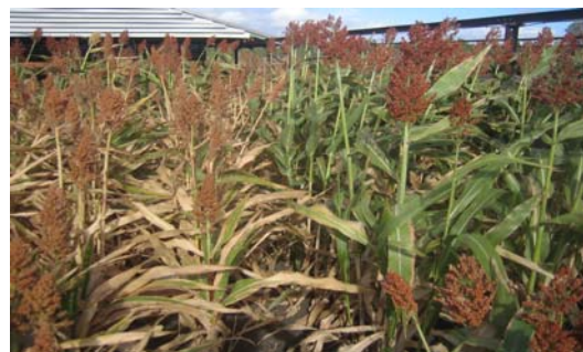
Senescent versus stay-green sorghum lines (2-dwarfs) at the rain-out shelter facility.

The stay-green pair maintained grain yields even under stressed conditions, while yield in the senescent pair was reduced under stress. Height did not counteract the benefits of stay-green. On the contrary, under stress the tall type of the stay-green pair yielded more than the short type (Fig 1b).