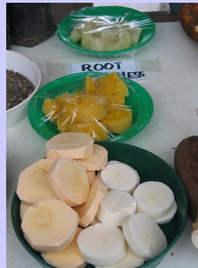
Fig 1. Micronutrient-dense cassava

Biplot analysis showed a good number of genotypes with very high levels of stable carotene contents across locations (Fig 2). They contrasted significantly from the three white checks. AMMI analysis identified seven genotypes as candidate genotypes for breeding for enhanced pro vitamin A in cassava. These genotypes include TMS 01/1371, TMS 01/1610, TMS 01/1277, TMS 01/1115, TMS 01/1412, TMS 01/1368 and TMS 01/1663. They were stable in their performance for carotenoid concentration across all locations studied. This corroborates earlier reports of carotenoid stability in cassava (Iglesias et al. 1997). Yellow garri derived from palm oil addition to white root cassava is well accepted in Nigeria and farmers mutually share valuable resources so it is expected that adoption will be easier if farmers and processors are involved early in yellow root variety development.