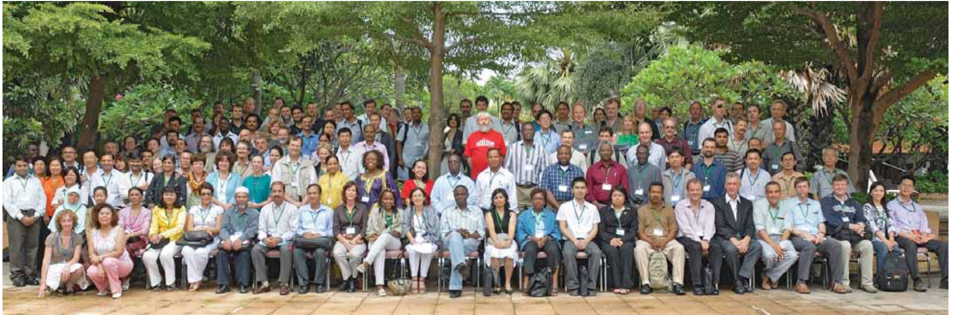
GCP Annual Research Meeting participants, September 2008, Bangkok, Thailand

—Excerpt from the External Programme and Management Review (EPMR) report, March 2008